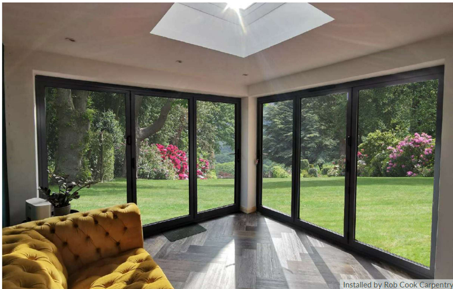
Installed by Rob Cook Carpentry

They require very little maintenance to ensure optimal performance and to keep them looking good as new.