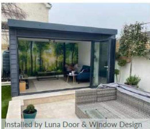
Installed by Luna Door & Window Design